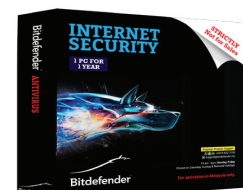
Bitdefender (worth RM 40)