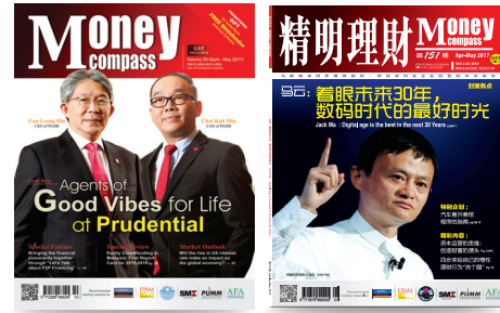
Newsstand Retail Price: RM15(WM), RM16(EM) E-Magazine Normal Price : RM5